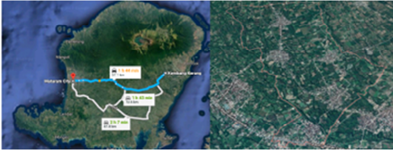
Picture 1. The map of Lombok area and Kembang Kerang village, the district of Aikmel, East Lombok*

In Lombok gula gending art also developed in the Mataram. A group of people that living in Lekoq village, North-Cakra, Mataram, most of them are people who come from the Kembang Kerang village that wandered selling the peddled their sugar candy around the Mataram city and even some that reached the Senggigi area. There are dozens of the people who travel every day to schools, markets or other places of crowd selling their wares. While peddling that their fiber sugar candy, while played the music, their playing the pesasakan music through the tangkaq or musical instruments that become a place for that fiber sugar candy. From the strains of the tones, it played by percussively by that instrument they are call the customer to buy their fiber sugar candy. As a general phenomenon that occurs related with the existence and sustainability of the traditional Sasak music, now the existence of gula gending music in Lombok besides it being used as a supporting tool by traders to lure buyers, it also used as media of creativities in the Sasak artists. The development of this musical instrument as a media of creativity is carried by the artists that have a high spirit of creativity and the large experience in the traditional music.