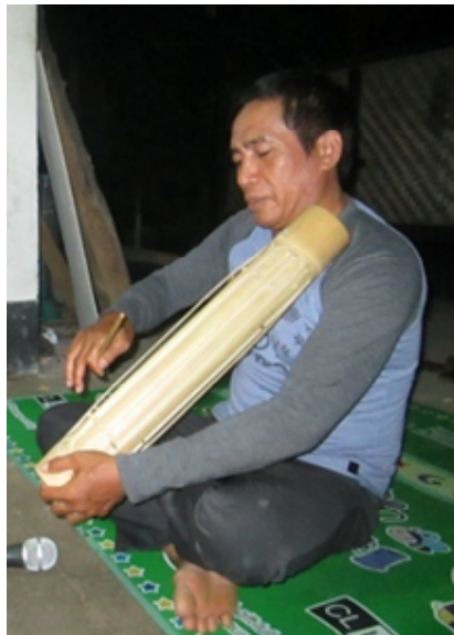
Picture 4. Sembir Bambu Instrument