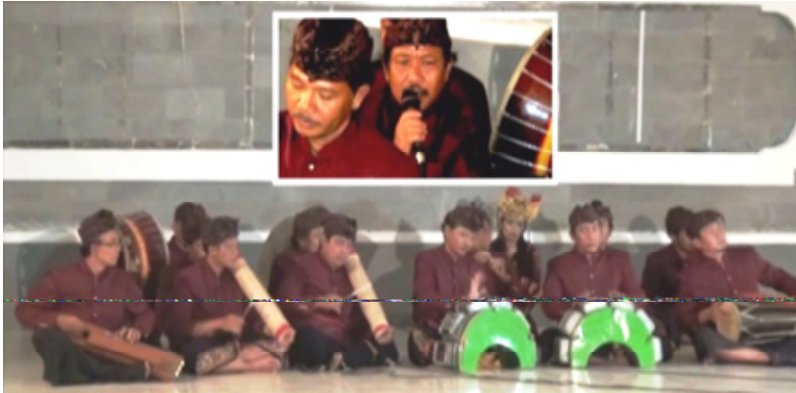
Picture 5 The development music of gula gending in context of Competitive Research Grant in 2016.

Creativity and development towards the gula gending music what was done in 2016 was also done by including vocal and dance elements. The inclusion of these two elements of performing arts makes the development in creativity of gula gending music that produces a performance art that is interesting and communicative.