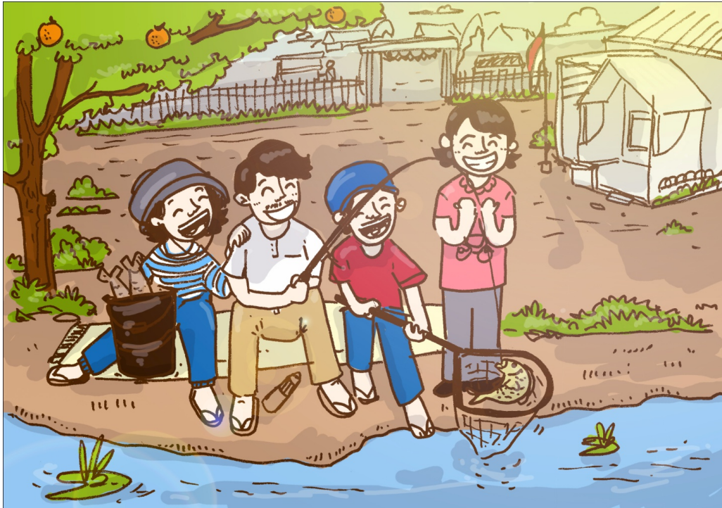
Figure-3. Harmonious Family