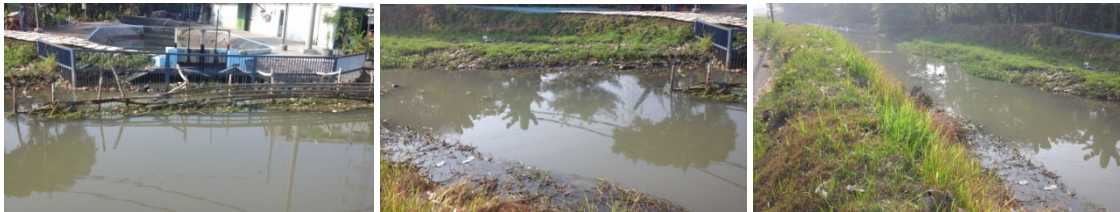
Figure-1. The River's Condition

Such problem within our society can be solved by understanding the behavior of the society itself. Hence, the waste-free river concept with social campaign creative strategy is essential to enhance the social-awareness of the river's vital function in our daily life.